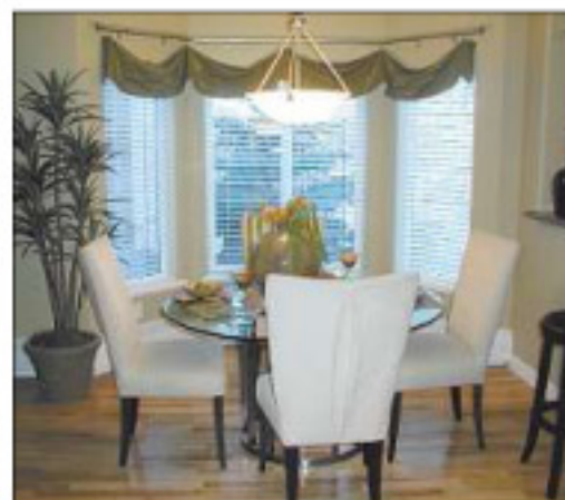
Bay window adds light to the nook.

from the Richmond Hill shopping area and on the way to the beauty of the Kananaskis along Highway 8.