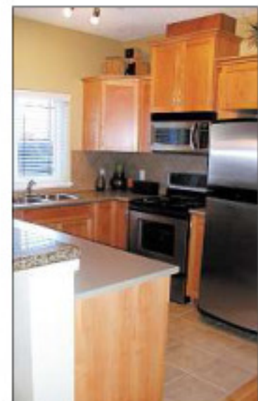
U-shaped kitchen has a granite eating bar opening to the nook and living room.