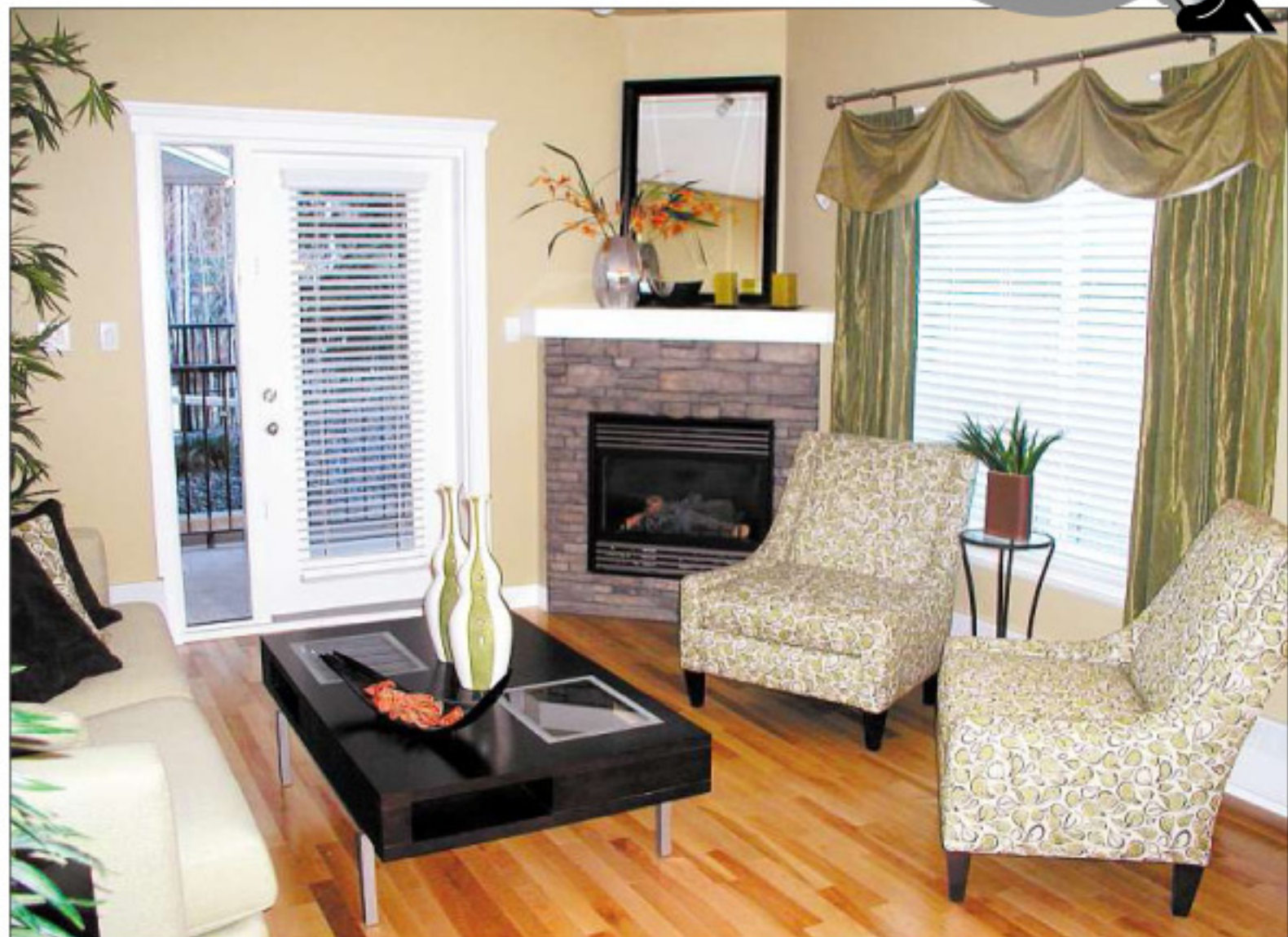
The Caravelle show suite has a wide open floor plan with a large living area with patio french doors and a corner fireplace.