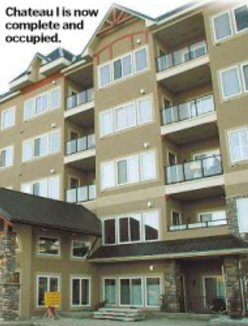
Chateau I is now complete and occupied.

from the Richmond Hill shopping area and on the way to the beauty of the Kananaskis along Highway 8.